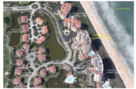
Built in 2005 - 60 units - 11 floors

Hammock Dunes Bridge Association Southern States Management Group 2 Camino del Mar Palm Coast, FL 32137 (386) 446-6333 http://daytonapropertymanagement.com/community/cambria-at-hammock-dunes-condominium