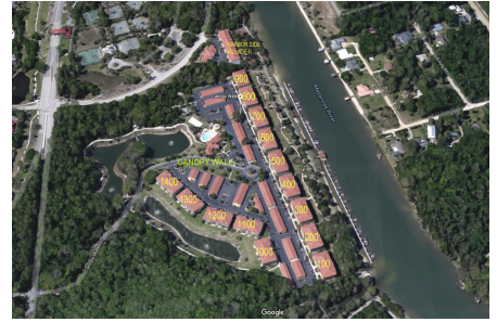
Built in 2004 - 242 units - 4 floors

Canopy Walk Address: 800 Canopy Walk Ln, Palm Coast, FL 32137 http://www.canopywalkca.com/canopywalk/home.asp