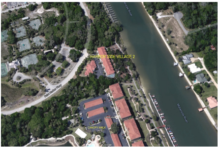
Built in 2003 - 14 units - 2 floors

HARBOR SIDE VILLAGE II CONDOMINIUM ASSOCIATION, INC 50 PALM HARBOR PARKWAY PALM COAST P.O. BOX 352926 FL 32137 (386) 246-9274