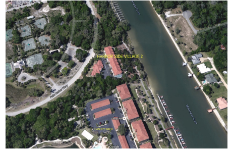
Built in 2003 - 14 units - 2 floors

HARBOR SIDE VILLAGE II CONDOMINIUM ASSOCIATION, INC 50 PALM HARBOR PARKWAY PALM COAST P.O. BOX 352926 FL 32137 (386) 246-9274