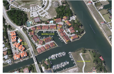
Built in 1990 - 84 units - 3 floors

Marina Cove Condo Association Address: 101 Palm Harbor Pkwy #310, Palm Coast, FL 32137, Phone:+1(386) 446 1024 (386) 446-3623