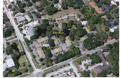
Built in 1975 - 56 units - 2 floors

SHANGRI-LA HOME OWNERS ASSOCIATION AT PALM COAST, Business Address 316 Palm Coast Pkwy PO BOX 351308 Palm Coast