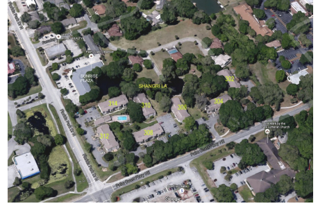
Built in 1975 - 56 units - 2 floors

SHANGRI-LA HOME OWNERS ASSOCIATION AT PALM COAST, Business Address 316 Palm Coast Pkwy PO BOX 351308 Palm Coast