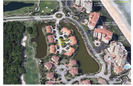
Built in 1997 - 24 units - 2 floors

Number of units: 24 Number of active listings for rent: 0 Number of active listings for sale: 0 Building inventory for sale: Number of sales over the last 12 months: 0% Number of sales over the last 6 months: 1 Number of sales over the last 3 months: 0