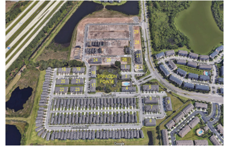
Built in 2015 - 184 units - 2 floors

Brandon Pointe Community Association Address: 2703 Isabella Valley Ct, Brandon, FL 33511, Phone: +1 813-643-8208 http://www.brandonpointehoa.com/brandonpointe/home.asp