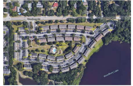
Built in 2001 - 198 units - 2 floors

Regency Key Management Company Ameri-Tech Community Management 24701 U.S. Hwy 19 North – Suite 102 Clearwater, FL 33763 T: 813-636-0000 Ext. 311 AMERI-TECH Property http://regencykey.org/