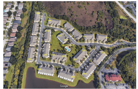
Built in 2011 - 132 units - 2 floors

http://www.vistacaytownhomeshoa.com/vistacay/