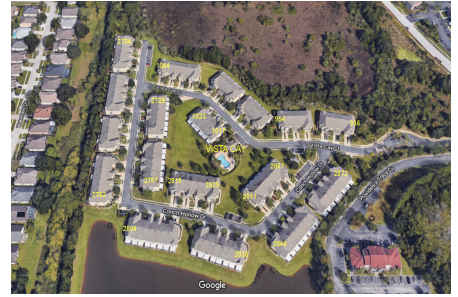
Built in 2011 - 132 units - 2 floors

http://www.vistacaytownhomeshoa.com/vistacay/