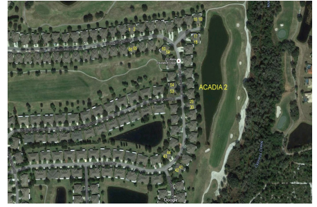
Built in 2001 - 66 units - 1 floor

Number of units: 66 Number of active listings for rent: 0 Number of active listings for sale: 1 Building inventory for sale: 1% Number of sales over the last 12 months: 4 Number of sales over the last 6 months: 2 Number of sales over the last 3 months: 0