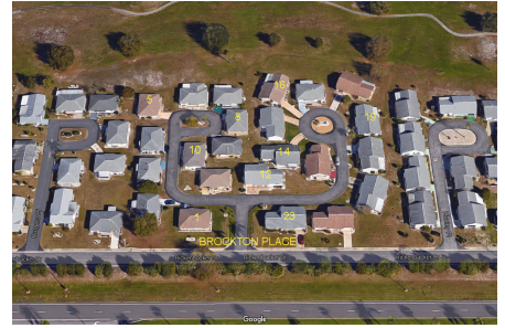
Built in 1975 - 23 units - 1 floor

Number of units: 23 Number of active listings for rent: 0 Number of active listings for sale: 1 Building inventory for sale: 4% Number of sales over the last 12 months: 2 Number of sales over the last 6 months: 2 Number of sales over the last 3 months: 1