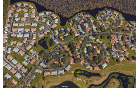
Built in 1982 - 122 units - 1 floor