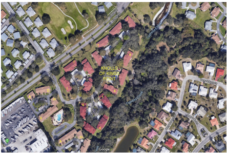
Built in 1982/1990 - 106 units - 2 floors

Kings Point Management LLC Address: 1904 Clubhouse Dr, Sun City Center, FL 33573 Phone: +1 813-642-8990