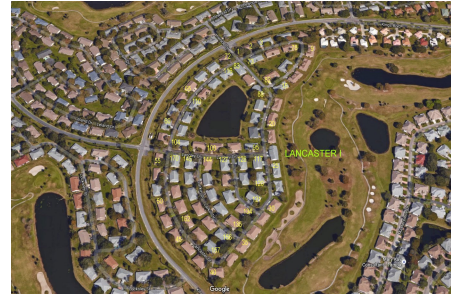
Built in 1987 - 170 units - 1 floor