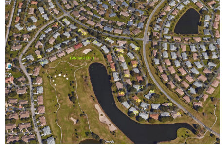
Built in 1989 - 104 units - 1 floor