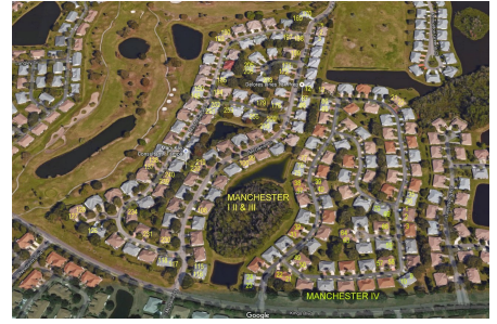
Built in 1990 - 258 units - 1 floor

Number of units: 258 Number of active listings for rent: 0 Number of active listings for sale: 4 Building inventory for sale: 1% Number of sales over the last 12 months: 12 Number of sales over the last 6 months: 3 Number of sales over the last 3 months: 1