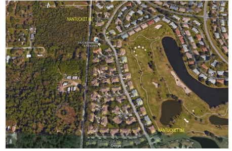
Built in 1991 - 156 units - 1 floor