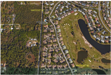
Built in 1991 - 156 units - 1 floor