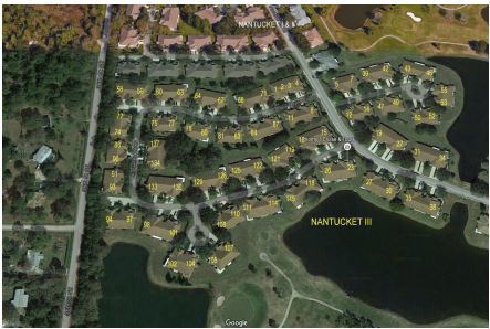
Built in 1994 - 137 units - 1 floor