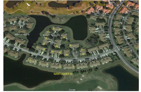
Built in 1996 - 52 units - 1 floor