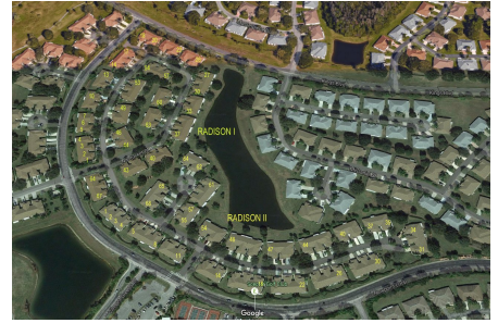
Built in 1998 - 67 units - 1 floor