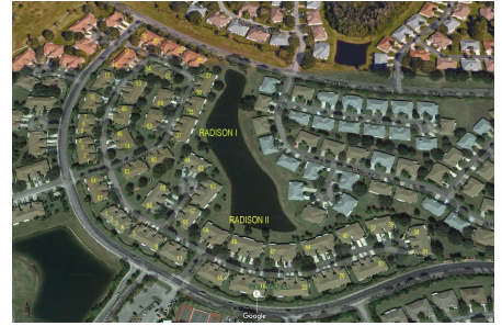
Built in 1998 - 68 units - 1 floor