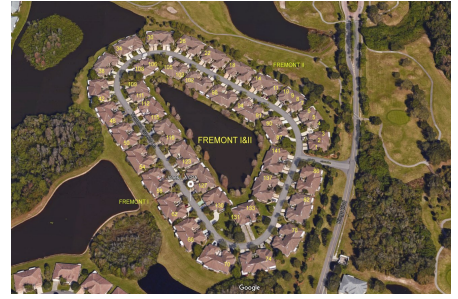
Built in 1999 - 141 units - 1 floor

1904 Clubhouse Dr Sun City Center Ph: 813-642-8790 URL: http://kpscc.com/