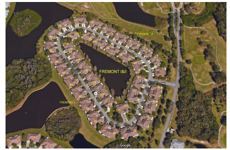
Built in 1999 - 141 units - 1 floor