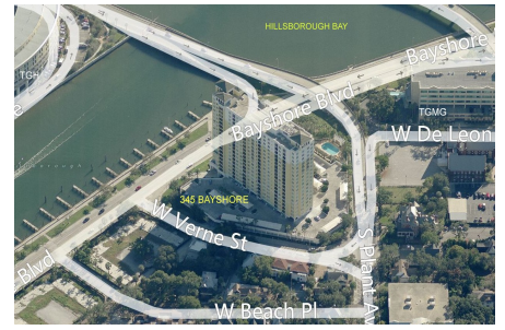
Built in 1998 - 239 units - 21 floors

345 Bayshore Condominium Association 345 Bayshore Blvd, Tampa, FL 33606 (813) 254-2900