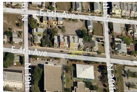
Built in 2007 - 12 units - 3 floors

4TH AVENUE LOFTS CONDOMINIUM ASSOCIATION, INC. WEST COAST MANAGEMENT & REALTY INC 14813 TURNER RD TAMPA FL 33624 PHONE 813-908-0766 FAX 813-908-6833