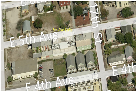
Built in 2005 - 8 units - 3 floors

5TH AVENUE LOFTS OF YBOR CITY CONDOMINIUM ASSOCIATION, INC. UNIQUE PROPERTY SERVICES INC 1207 N HIMES AVE STE 3 TAMPA FL 33607 PHONE 813-879-1139 FAX 813-879-1039