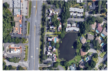
Built in 1983 - 52 units - 2 floors

CARROLLBROOK LAKESIDE CONDOMINIUM ASSOCIATION, INC. C/O UNIQUE PROPERTY SERVICES 1207 N. HIMES AVENUE SUITE # 3 TAMPA, FL 33607 813 879 1139