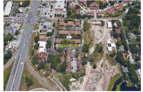
Built in 1982 - 64 units - 2 floors

Number of units: 64 Number of active listings for rent: 1 Number of active listings for sale: 0 Building inventory for sale: Number of sales over the last 12 months: 0% Number of sales over the last 6 months: 5 Number of sales over the last 3 months: 1