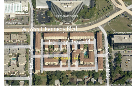
Built in 2004 - 166 units - 3 floors

CORDOBA AT BEACH PARK CONDOMINIUM ASSOCIATION, INC 114 Beach Haven Ln, Tampa, FL 33609 (813) 286-9075