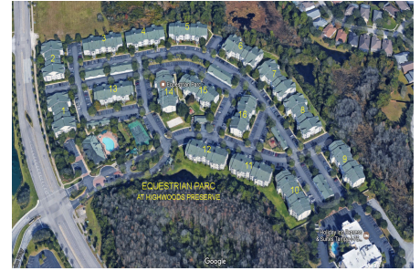
Built in 2003 - 384 units - 3 floors

Equestrian Parc Condominium Complex Address: 18201 Highwoods Preserve Pkwy, Tampa, FL 33647 Phone: +1 813-910-0830 https://parcequestrian.wordpress.com/