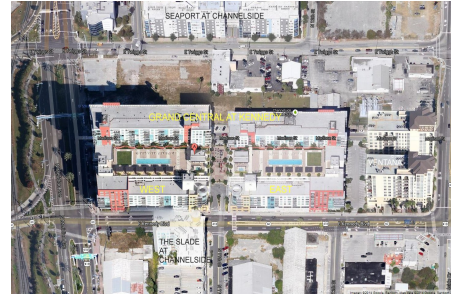
Built in 2007 - 176 units - 12 floors

Grand Central At Kennedy Association 1120 E Kennedy Blvd #208, Tampa, FL 33602 (813) 226-0991 http://grandcentralatkennedy.com/