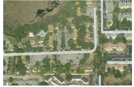
Built in 1984 - 264 units - 2 floors