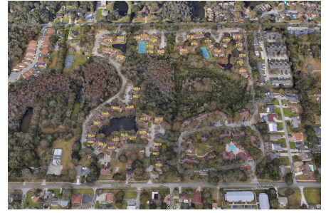
Built in 1988 - 384 units - 2 floors