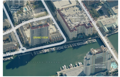
Built in 2002 - 64 units - 19 floors

Grandview of Tampa Condominium Association is managed by OMNI Management Services, Inc Ft. Meyers/Tampa Area 8695 College Parkway, Suite 1274 Ft.Meyers, FL 33919 Local number: 321-280-7412 After Hours Emergency: 888-541-0018 http://www.grandviewcoa.com/