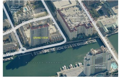
Built in 2002 - 64 units - 19 floors

Grandview of Tampa Condominium Association is managed by OMNI Management Services, Inc Ft. Meyers/Tampa Area 8695 College Parkway, Suite 1274 Ft.Meyers, FL 33919 Local number: 321-280-7412 After Hours Emergency: 888-541-0018 http://www.grandviewcoa.com/