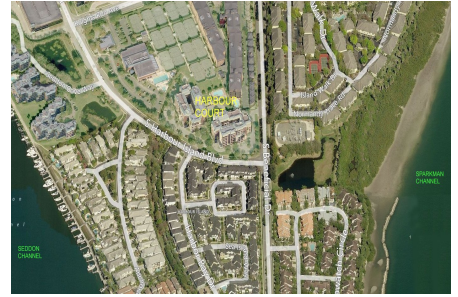
Built in 1987 - 128 units - 7 floors

Harbour Court Condominium Association 1002 S Harbour Island Blvd, Tampa, FL 33602 (813) 221-4143