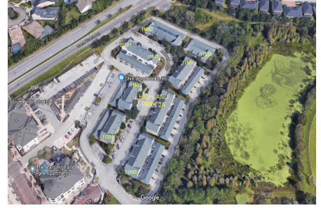
Built in 2012 - 40 units - 2 floors

Highland Park Neighborhood Association 4131 Gunn Highway Tampa, FL 33618 Phone: (813) 969-1857