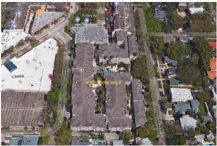
Built in 1996 - 134 units - 4 floors