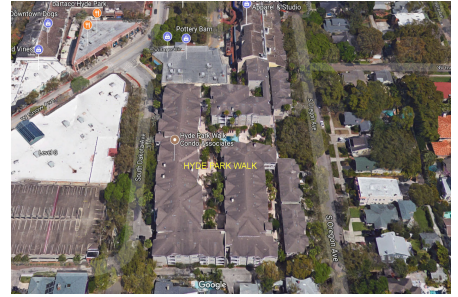
Built in 1996 - 134 units - 4 floors

Number of units: 134 Number of active listings for rent: 1 Number of active listings for sale: 0 Building inventory for sale: Number of sales over the last 12 months: 0% Number of sales over the last 6 months: 4 Number of sales over the last 3 months: 1