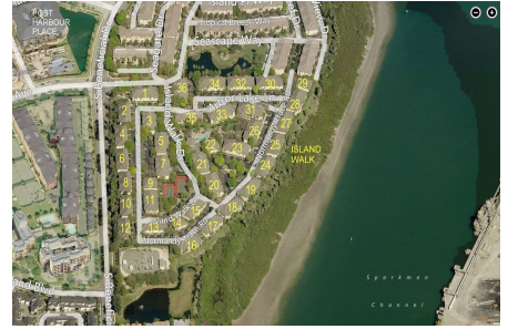
Built in 1991 - 272 units - 2 floors

ISLAND WALK CONDOMINIUM ASSOCIATION, INC. KRAMER TRIAD MANAGEMENT 3050 HORSESHOE DR N STE 275 NAPLES FL 34104 PHONE 239-263-1577