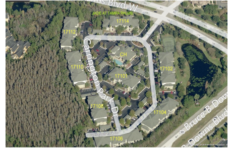
Built in 2004 - 248 units - 3 floors

Jade At Tampa Palms Address: 16801 Tampa Palms Blvd W, Tampa, FL 33647 Phone:(813) 514-6105 JADE AT TAMPA PALMS CONDOMINIUM ASSOCIATION, INC. TERRA MANAGEMENT SERVICES 4809 EHRLICH RD STE 104 TAMPA FL 33624 PHONE 813-374-2363