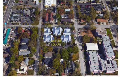
Built in 1989 - 52 units - 3 floors

Number of units: 52 Number of active listings for rent: 1 Number of active listings for sale: 0 Building inventory for sale: Number of sales over the last 12 months: 0% Number of sales over the last 6 months: 1 Number of sales over the last 3 months: 0