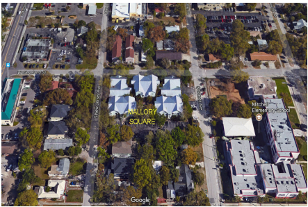
Built in 1989 - 52 units - 3 floors