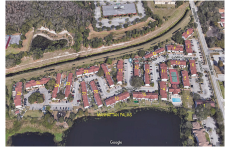
Built in 1974 - 192 units - 2 floors

Manhattan Palms Condominium Association Inc 7210 N Manhattan Ave, Tampa, FL 33614 (813) 885-2704