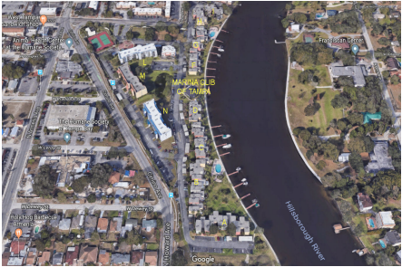
Built in 1985 - 241 units - 4 floors

Marina Club of Homeowners Association 2424 West Tampa Bay Boulevard Office D106 Tampa, FL 33607 Phone: (813) 876-6791