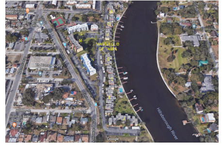
Built in 1985 - 241 units - 4 floors

Marina Club of Homeowners Association 2424 West Tampa Bay Boulevard Office D106 Tampa, FL 33607 Phone: (813) 876-6791