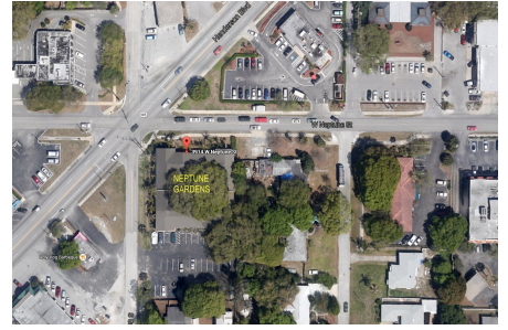
Built in 1973 - 31 units - 2 floors

NEPTUNE GARDENS CONDOMINIUM ASSOCIATION, INC 813 289 0651