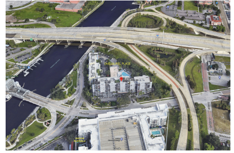
Built in 1982 - 97 units - 10 floors

One Laurel Place Condominiums Address: 201 W Laurel St, Tampa, FL 33602, Phone: +1 813-229-7425