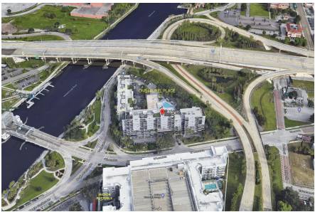
Built in 1982 - 97 units - 10 floors

One Laurel Place Condominiums Address: 201 W Laurel St, Tampa, FL 33602, Phone: +1 813-229-7425