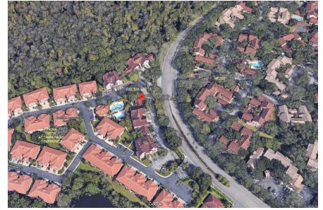
Built in 1990 - 40 units - 2 floors

Palma Vista Townhomes at Tampa Palms Address: 4978 Anniston Cir, Tampa, FL 33647 https://www.palmavistatownhomes.com/