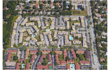
Built in 1974 - 361 units - 2 floors

Palmera Pointe Condominiums Address: 7417 Palmera Pointe Cir, Tampa, FL 33615 Phone: +1 813-915-5870