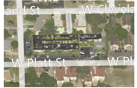
Built in 1973 - 35 units - 2 floors

PALMS OF BEACH PARK CONDOMINIUM ASSOCIATION, INC INFINITI PROPERTY MANAGEMENT / QUALIFIED PROPERTY MANAGEMENT, INC 7210 N MAHATTAN AVE TAMPA FL PHONE 727-869-9700 FAX 727-869-9825