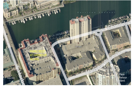
Built in 2005 - 334 units - 9 floors

Parkcrest HarbourIsland Property Manager 700 South Harbour Island Blvd Tampa, FL 33602 P 813-229-2500 F 813-229-2505 http://www.continentalconnect.com/parkcrestharbourisland