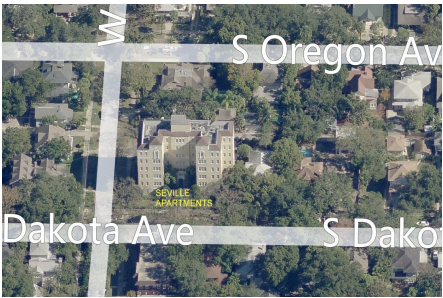
Built in 1926 - 12 units - 6 floors