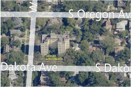
Built in 1926 - 12 units - 6 floors