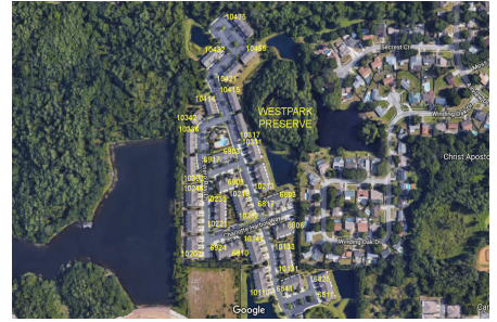
Built in 2012 - 196 units - 2 floors