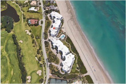
Built in 1981 - 62 units - 4 floors

2001 Sailfish Point Blvd Condominium Association Inc 2001 SE Sailfish Point Boulevard Stuart, FL 34996 (772) 225-2001